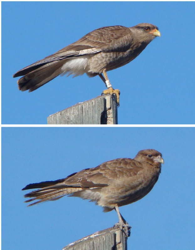
Fig. 1 Wild Chimango Caracara ( Milvago chimango ) showing light-brown plumage and the two distinct colour patterns of colouration of the ceres and tarsi recorded for birds captured during the study (colour figure online)

Approximately 1 ml of blood was taken from each bird from the brachial vein using a heparinized syringe. The blood was placed in tubes and kept in a cooler until centrifugation (3,000 rpm \times 10 min), which occurred within